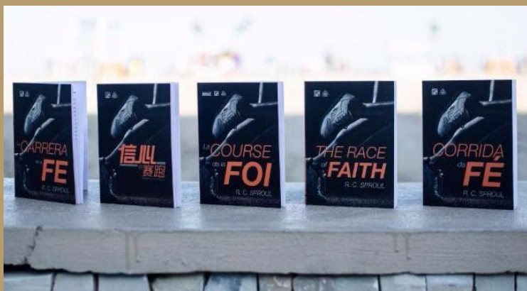
Click to hear audio interview