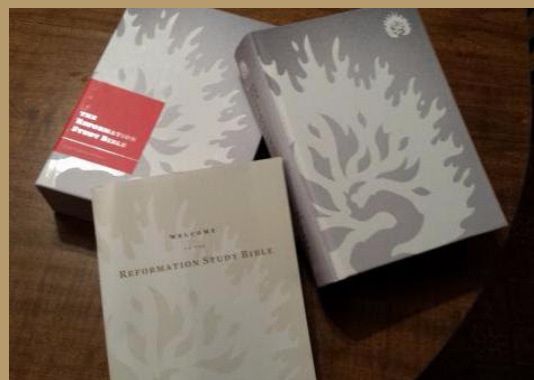
REFORMATION STUDY BIBLE