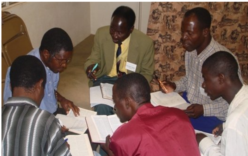
Mozambique pastors learning how to prepare expository sermons