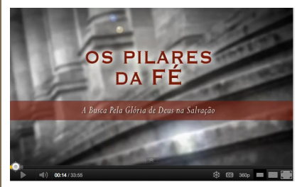
click to watch: the message on Unconditional Election.

This and many other resources are given away for